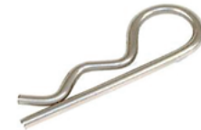
Cotter Pin, Part # PTSARCH10