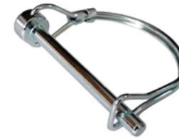
D-type Latch, Part # PTSARCH12