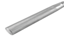
Spigot, Part # PTSARCH09