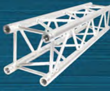
4.92' (1.5 m) CT290-415S