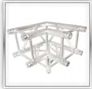
3-WAY 90° CORNER CT290-4390C 12" (290 mm) Truss Makes squares or rectangles