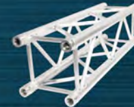
3.28' (1 m) CT290-410S