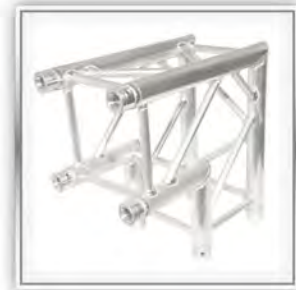
2-WAY 90° CORNER CT290-490C 12" (290 mm) Truss Makes squares or rectangles