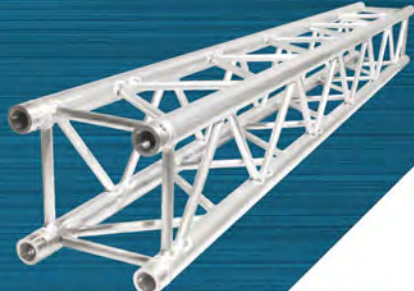
8.20' (2.5 m) CT290-425S