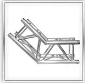
2-WAY 135° CORNER CT290-4135C 12" (290 mm) Truss Makes octagons