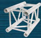
1.64' (0.5 m) CT290-405S