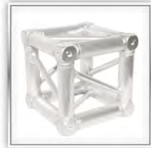
6-WAY CORNER BLOCK CT290-6WAYC 12" (290 mm) Truss Most versatile