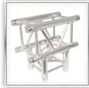
3-WAY "T" JUNCTION CT290-43TC 12" (290 mm) Truss Makes squares or rectangles