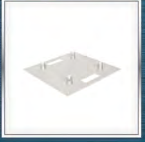
CT290-4116B 16" (406 mm)