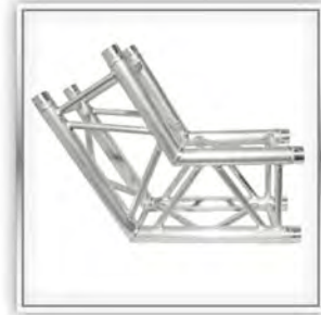
2-WAY 120° CORNER CT290-4120C 12" (290 mm) Truss Makes hexagons