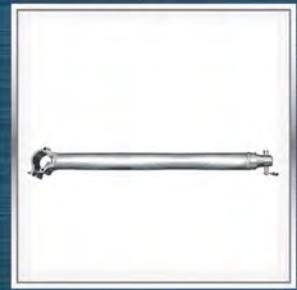
CT-40110P 3.28' (1 m)