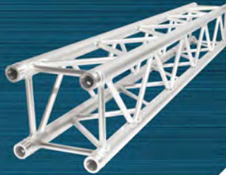
6.56' (2 m) CT290-420S