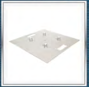
CT290-4124B 24" (610 mm)