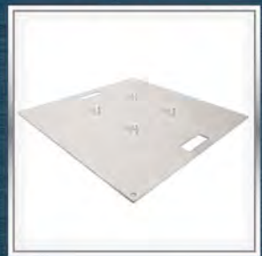
CT290-4130B 30" (762 mm)