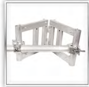
2-WAY BOOK HINGE CT290-4HC 12" (290 mm) Truss Makes adjustable angles