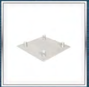
CT290-4112B 12" (305 mm)